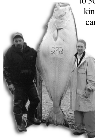
(two per day) of these tasty flatfish.

The early run of king salmon fishing produced some great days of limit catches. Saltwater anglers are allowed to keep one king salmon per day. Most of these fish range in the 20